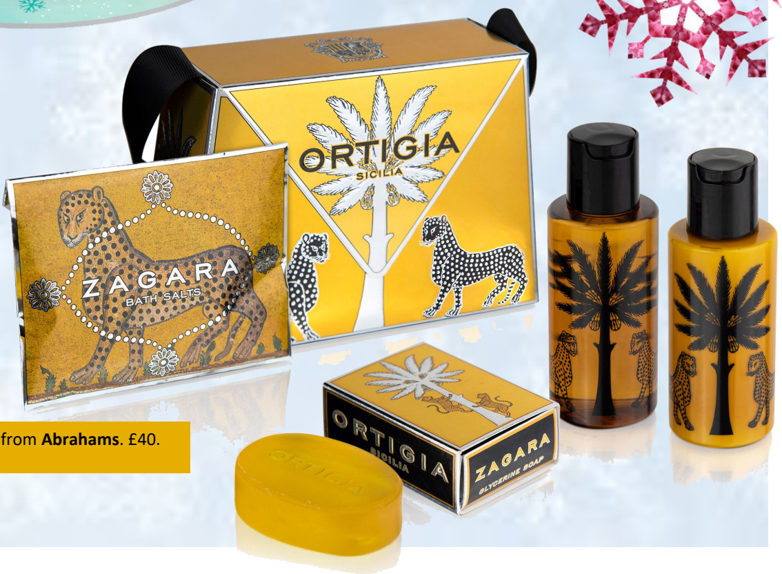
Elegant Zagara Gift Set by Ortigia from Abrahams . £40.