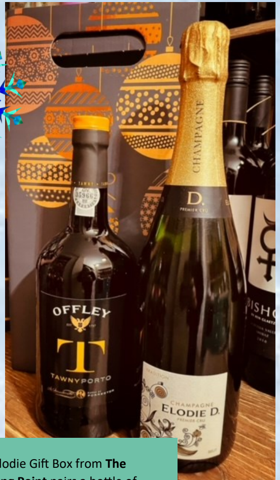
This Elodie Gift Box from The Crossing Point pairs a bottle of Premier Cru champagne with a bottle of Offley Tawn Port for £57.